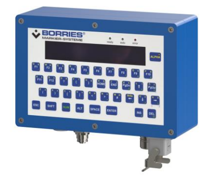
Fig. EK2 box, IP 53