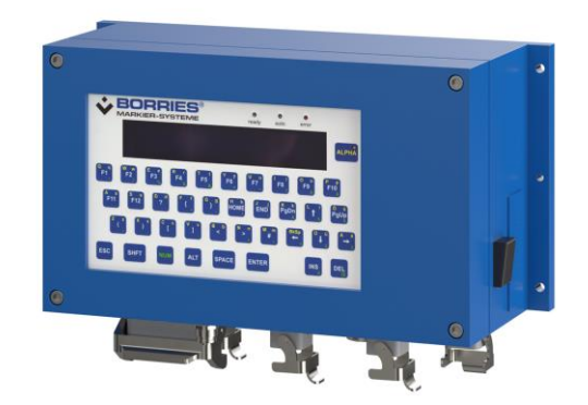
Fig. EG2 box, IP 54