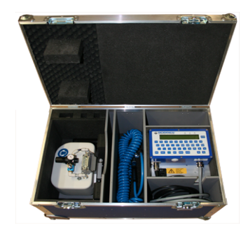
Fig. transportation case complete with marker and EK2 box