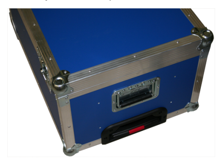
Fig. of transportation case for 313VVM

Possibility of data input via barcode scanner